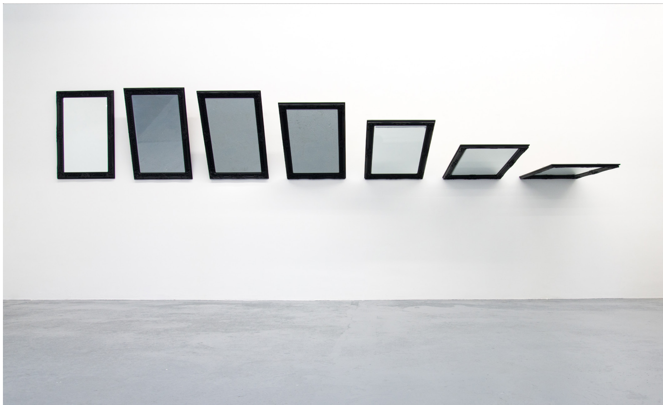
Sali Muller, Neigung, 2018, Mirrors, 90 x 520 x 90 cm